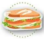
Ziploc & other reclosable food storage bags