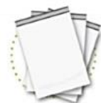
Plastic shipping envelopes