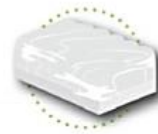
Wood pellet bags